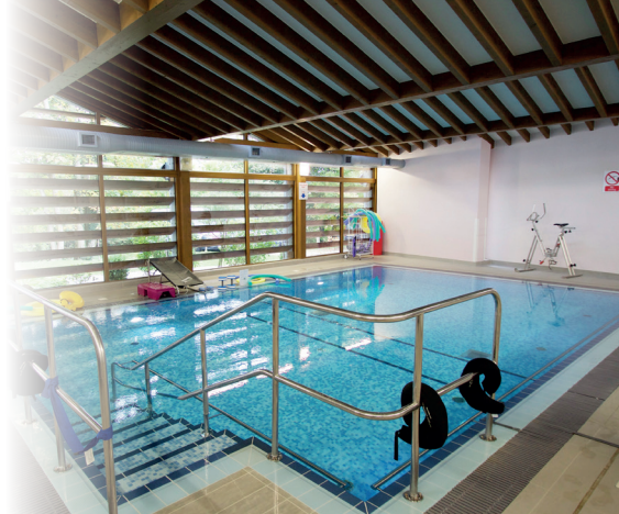
Holy Cross Hospital: Hydrotherapy Room