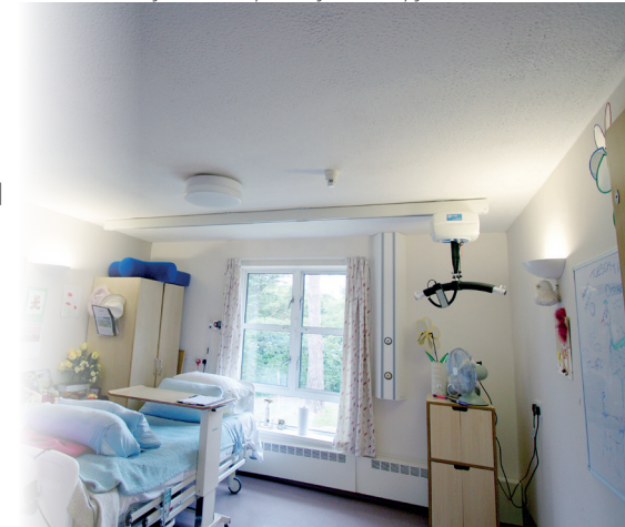
Holy Cross Hospital: Patient Bedroom