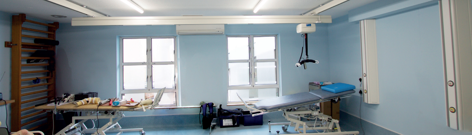
Holy Cross Hospital: Physiotherapy Room