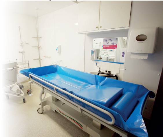
Holy Cross Hospital: Shower Trolley in Wet-room

For more information, contact the OpeMed Team and call +44 (0) 1252 758858