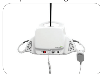
Ideal for the Monarch Portable Ceiling Hoist