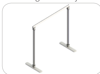
Available in subtle off-white colour