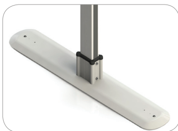
Thin base to reduce trip hazard