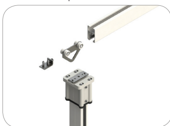
Height and length can be easily tailored on-site