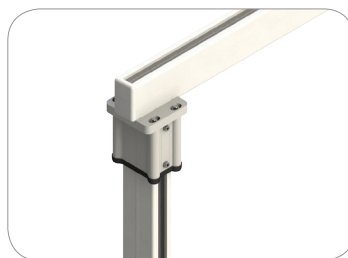
Easy to assemble with a single Allen Key