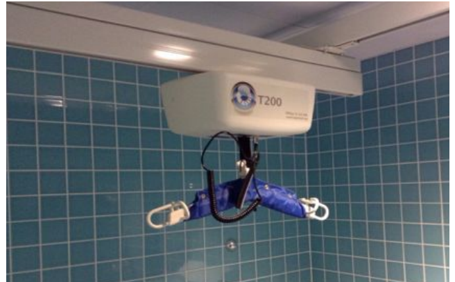
The OT200 ceiling hoist with standard spreader bar. Both hoist and track are very discreet featuring hidden brackets and white compact shells

Two Height Adjustable Washbasins were also installed to enable any users in wheelchairs easy access to the sink at a height suitable to them. These systems are adjustable by simple hand control and include a mirror and light system.