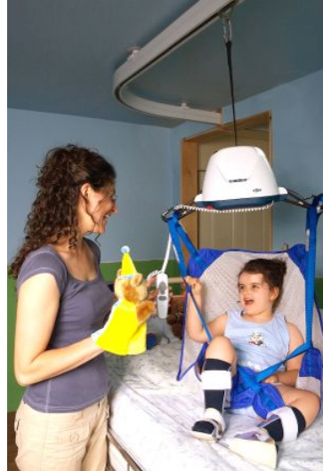
OpeMed Portable Ceiling Hoist in 2 bedrooms at Legoland Hotel for quick and safe Bed-Chair and WC-Chair-Shower transfer

The Ceiling Hoists are installed in The Standard Kingdom and The Standard Adventure rooms in the hotel, which also feature a zip and link bed and wheelchair access forming 2 of the 14 accessible rooms.