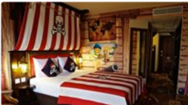
Adventure style room at the Legoland hotel